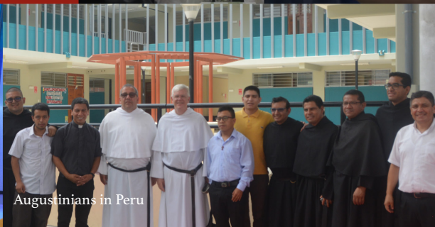
Augustinians in Peru