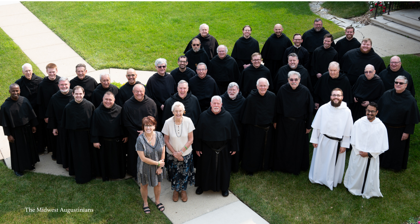
The Midwest Augustinians

We continue to serve the Church in schools, parishes and missions as we seek to discern new paths of service to which God calls us.